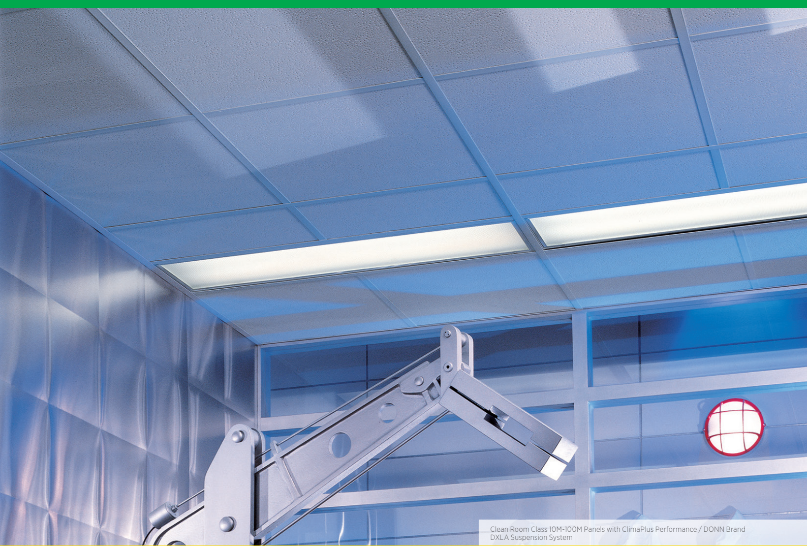
Clean Room Class 10M-100M Panels with ClimaPlus Performance / DONN Brand DXLA Suspension System